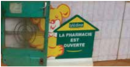
Hospital pharmacy, Ouagadougou

Two years after the violations observed by other organisations working on monitoring application of the Code, 22 we found Blédina mascots telling consumers about pharmacy opening hours in our Burkina Faso case study.