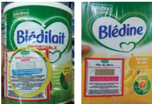
Mahima supermarket, Yaoundé

Formula milk special promotions and cross-promotion with complementary food.