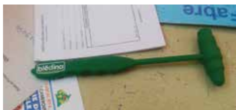
Maroua hospital, paediatrician's consulting room.

In Pakistan , 20% of health workers say they have received gifts from companies. The gifts tend to be note pads, pens and calendars with a highly visible logo. In Cameroon , ACF observed a great many supplies used by health professionals bearing the Blédina logo.